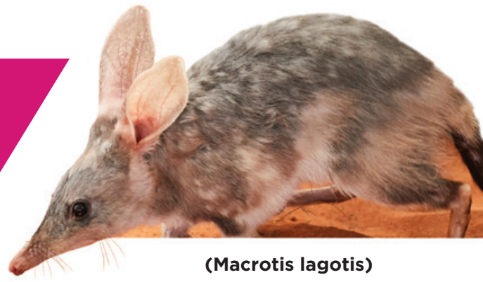
( Macrotis lagotis )